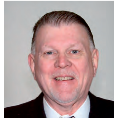
Commissioner THOMAS WINTERS