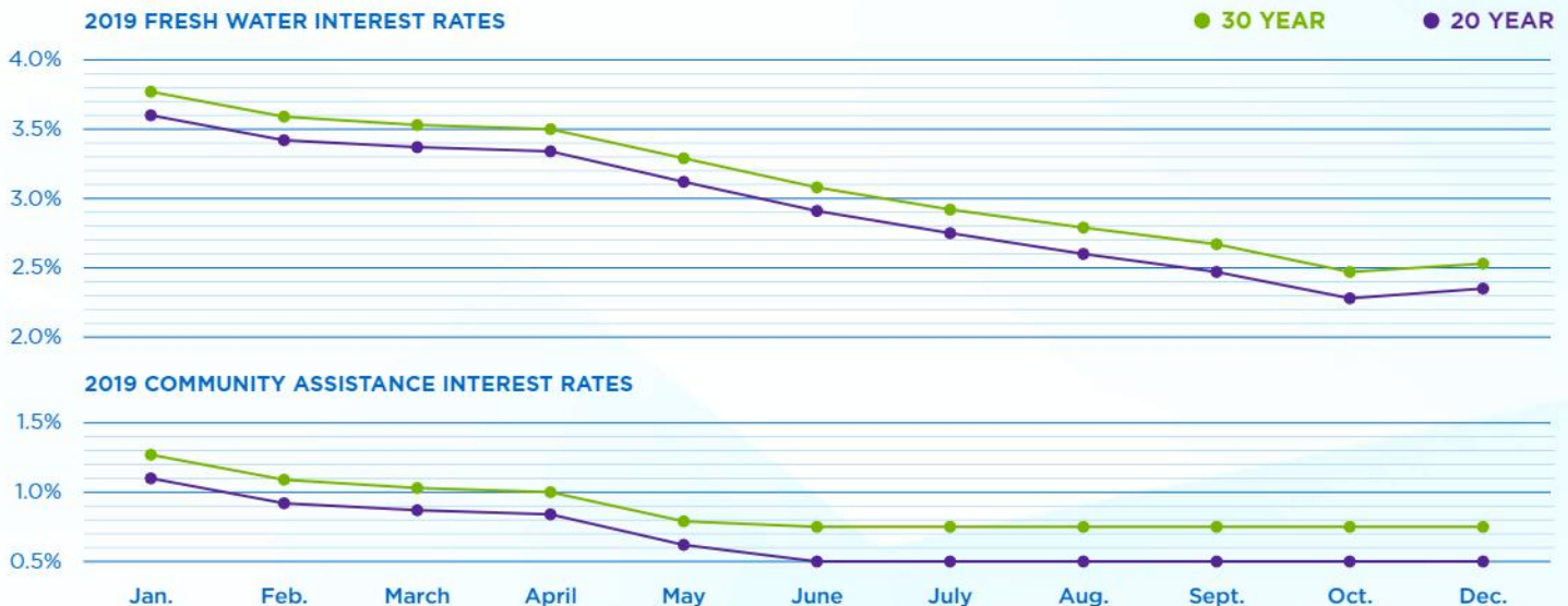
2019 COMMUNITY ASSISTANCE INTEREST RATES