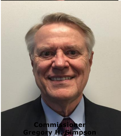
Commissioner Gregory H. Simpson