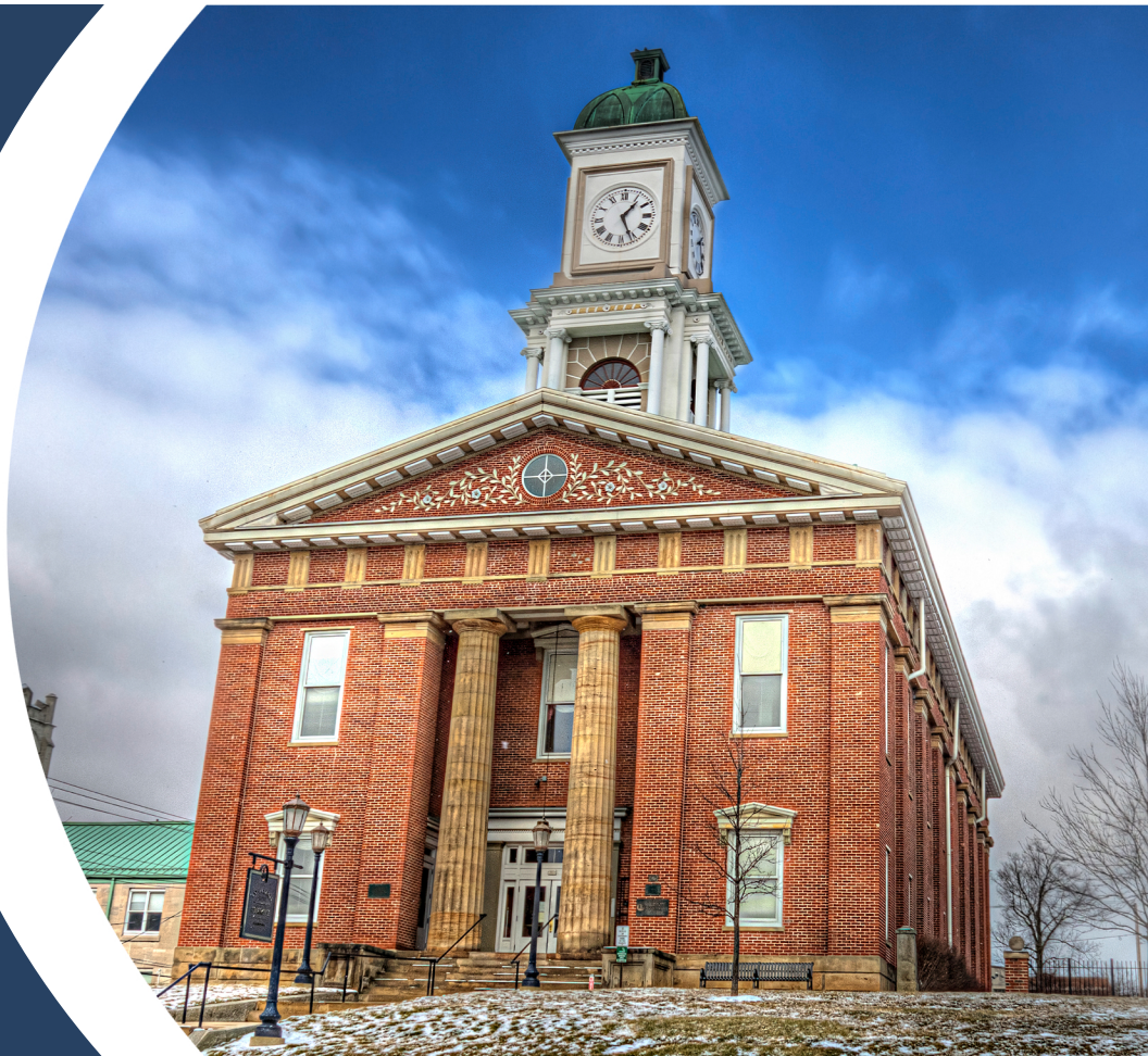
Photo: The Knox County Courthouse in Mount Vernon, Ohio by Mark Spearman is licensed under CC BY 2.0 / Cropped from original